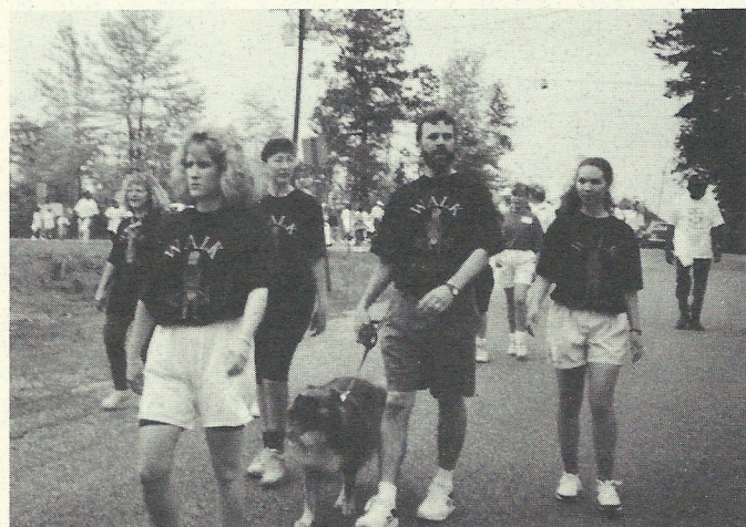
Hunt Plywood employees participating in March of Dimes Walk-A-Thon.