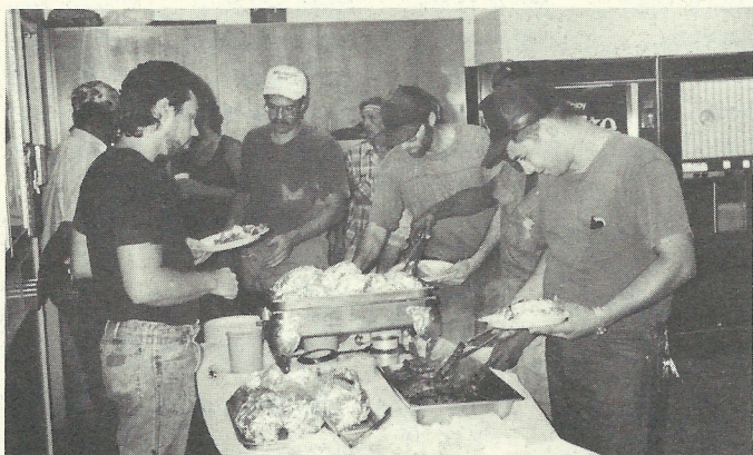
GE1 employees enjoying a steak dinner awarded for having a great safety record - 4 quarters without an accident.

Safety is not a pair of safety glasses, but the commonsense habit of wearing those glasses while working. Let's all try to develop commonsense safety habits and make a commitment to be accident free for the rest of 1993.