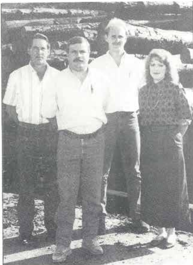
Castor Forestry Personnel